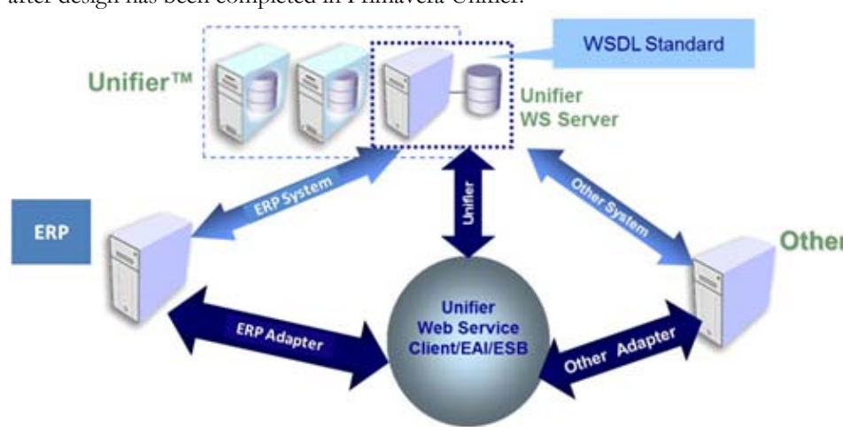
Figure 2. Web services architecture